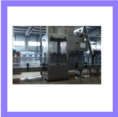
Automatic Jar Filling Machine