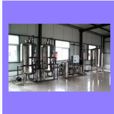
3000lph Mineral Water Treatment Plant