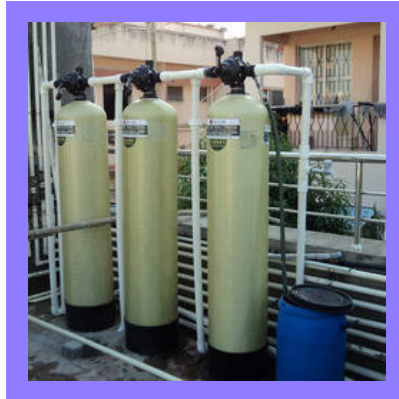
Demineralisation Water Plant