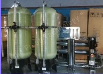
Mineral Water Treatment Plant