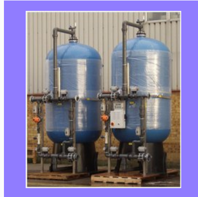
Pressure Sand Filters