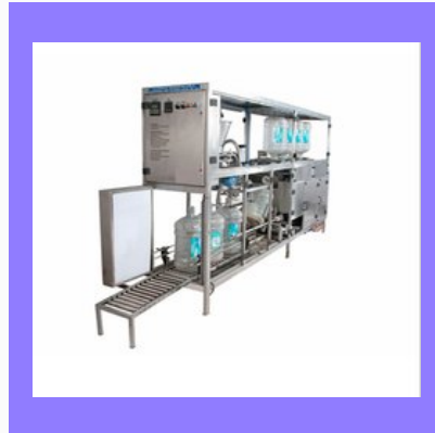
Semi Automatic Jar Filling Machines