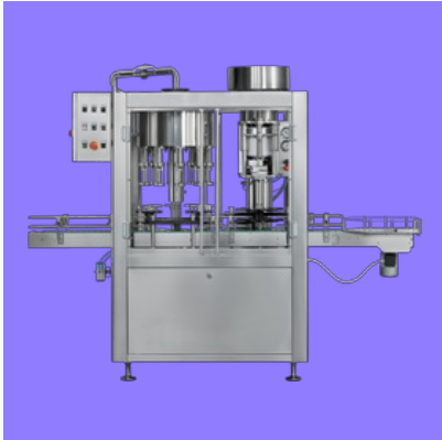
Shrink Sleeve Labeling Machine