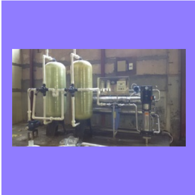
4000LPH Reverse Osmosis Plant