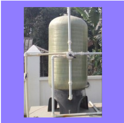
Pressure Sand Filters