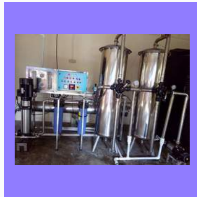
2000LPH Reverse Osmosis Plant