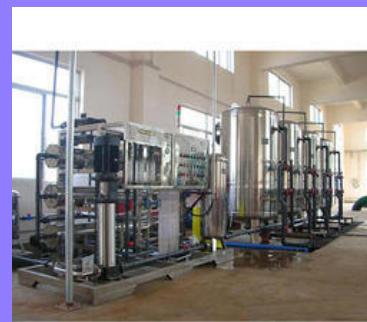
Mineral Water Treatment Plant