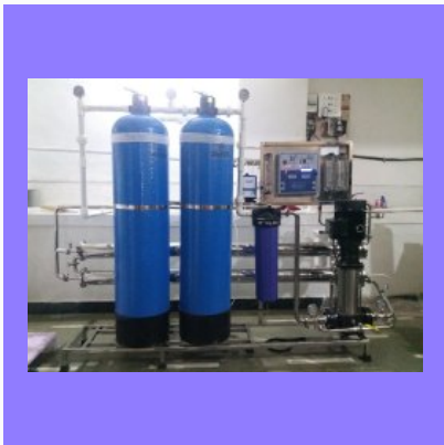
1000LPH Reverse Osmosis Plant