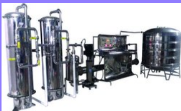
Wastewater Treatment Plant