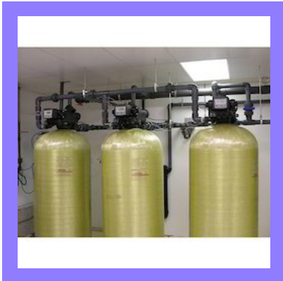
Water Softener Plant