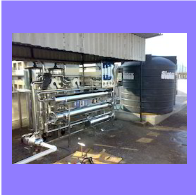
Fully Automatic Mineral Water Treatment Plant