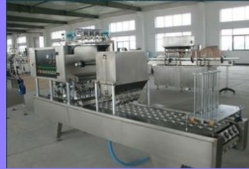
Automatic Glass Filling and Sealing Machine