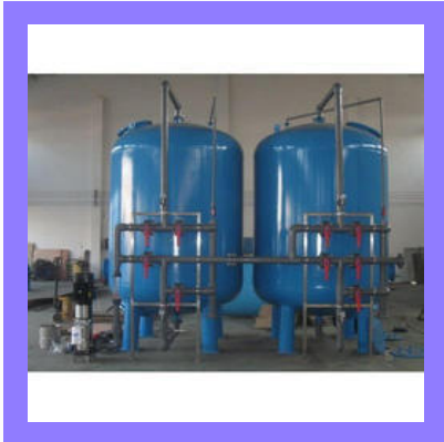
Sand & Multi Media Filtration Plant