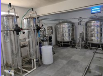
Industrial Reverse Osmosis Plant