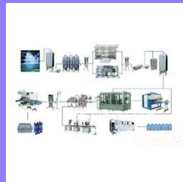
Mineral Water Turnkey Project