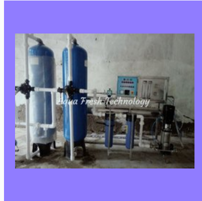
2000 LPH Reverse Osmosis Plant