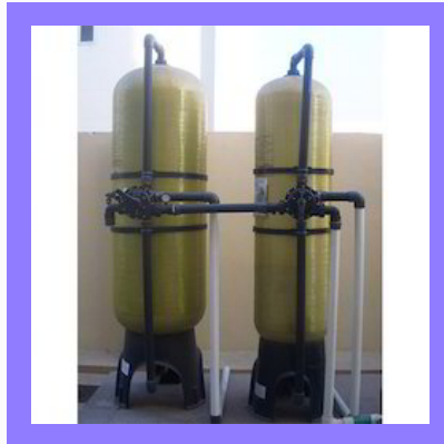
Water Softening Plant