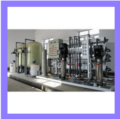
Mineral Water Treatment Plant